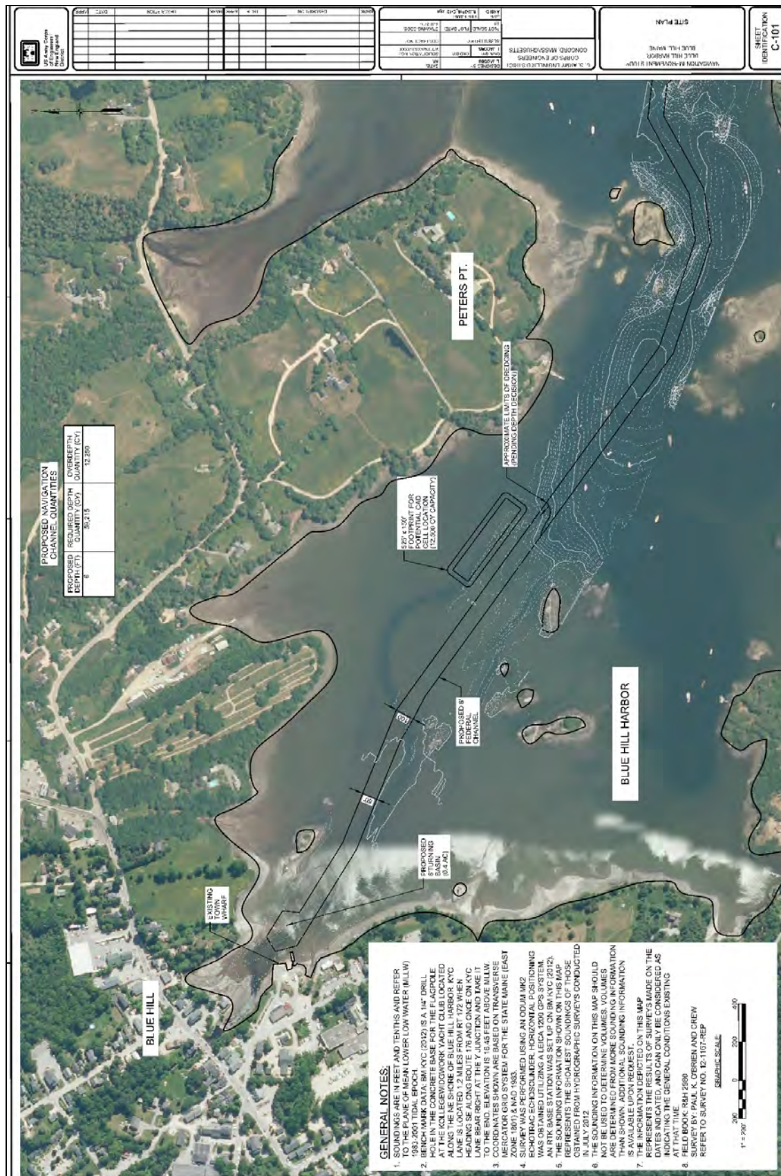
Figure 3 – Location of Plan A and Plan B