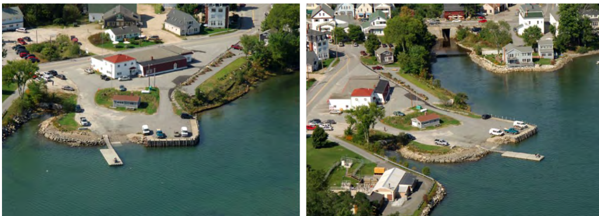
Figure 2 – West and Northwest at the Town-Owned Landing in Inner Blue Hill Harbor